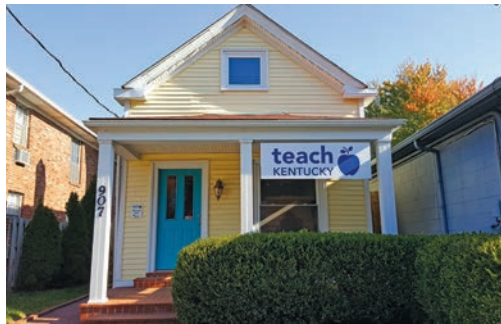
Teach Kentucky's new office