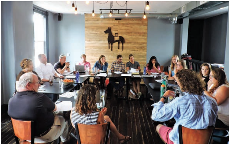
Teacher Council members convened for a daylong planning meeting to outline the group's objectives and goals for the 2016-2017 recruitment year.

This past year, TKY ramped up its Teacher Council - a group of veteran educators who provide guidance on various programmatic elements and initiatives. This group's teaching expertise, as well as its institutional knowledge of JCPS, ensures that Teach Kentucky makes well-informed and valuable organizational decisions related to educator recruitment, induction, and ongoing support.