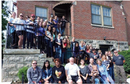
Teach Kentucky educators and community members gather at the Bardstown Road Saturday morning farmer's market.